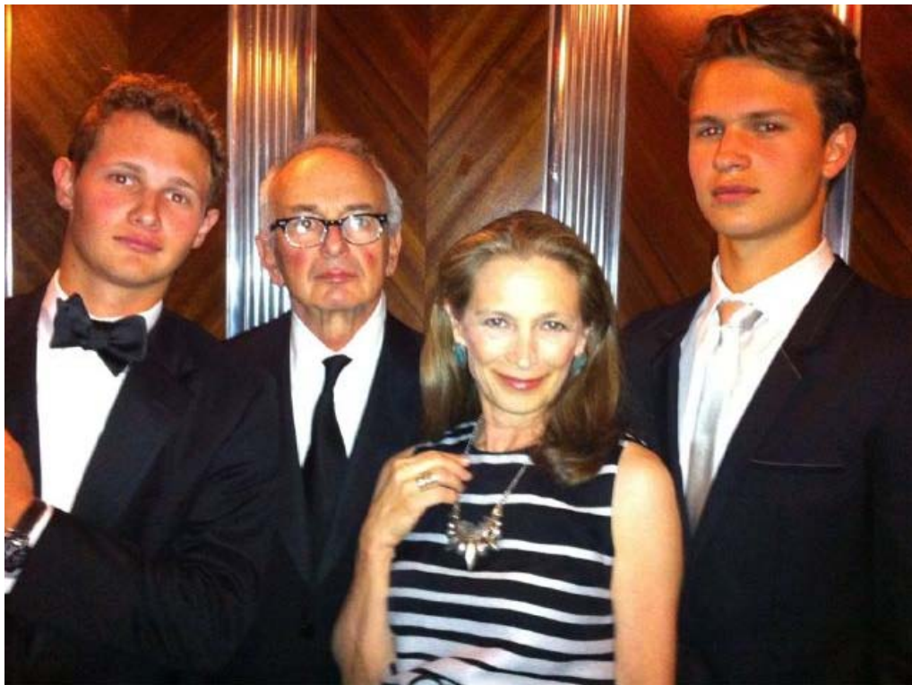
The Elgort family in the lift