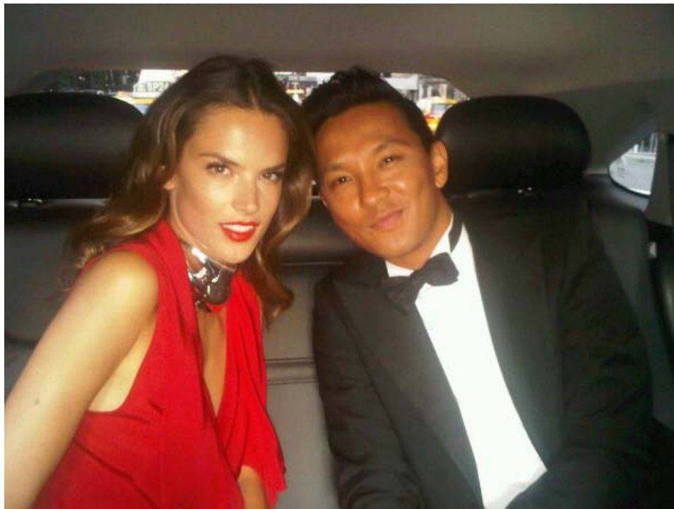
Prabal Gurung and Allesandra Ambrosio